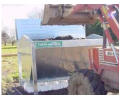
Open top access

Contact Tat-G Corp Pty Ltd on +61 0407 801 316 Or Email sales@tat-g.com.au