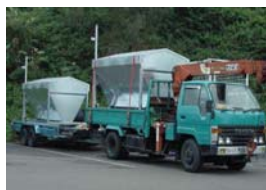
Delivered where you want it