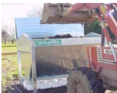
Open top access

Contact Tat-G Corp Pty Ltd on 0407 801 316 Or Email info@tat-g.com.au